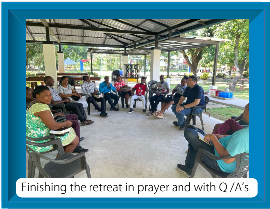
Finishing the retreat in prayer and with Q/A's