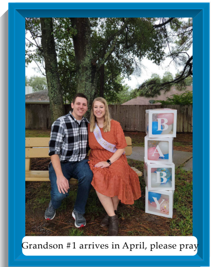
Grandson #1 arrives in April, please pray