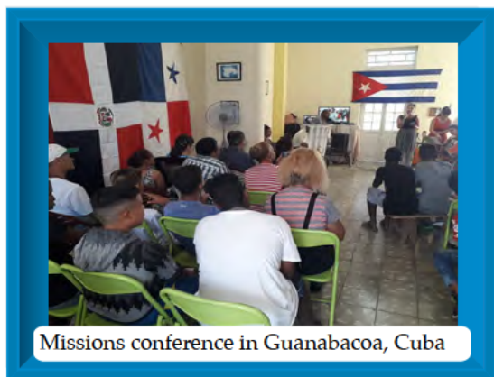
Missions conference in Guanabacoa, Cuba